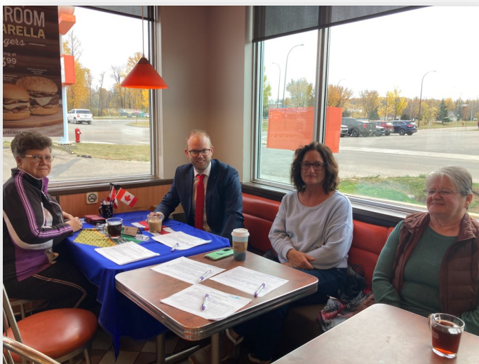
Meeting for coffee with constituents in Slave Lake