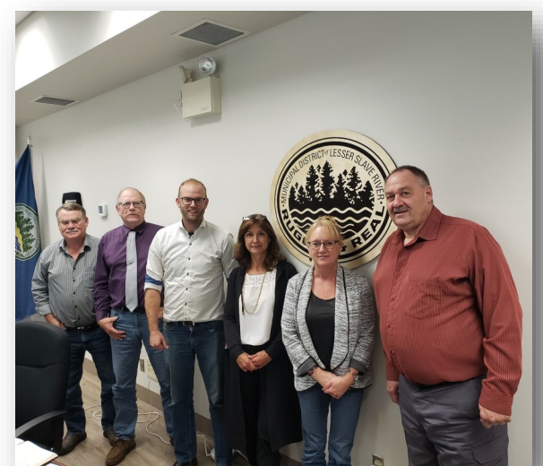
Meeting with MD of Lesser Slave River

FOLD TOP FIRST, THEN BOTTOM, AND TAPE SHUT TO RETURN, NO ENVELOPE OR STAMP NEEDED.