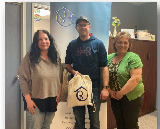
Visit to Westlock's Healthy Families, Healthy Futures