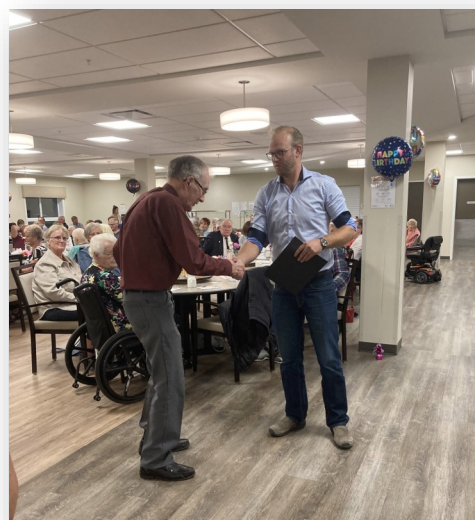
Celebrating at Hillcrest Lodge with people from across the riding who turned 90+