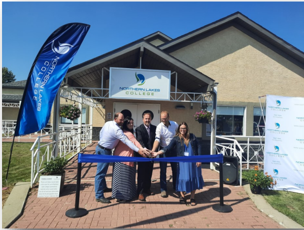
Opening of Northern Lake College - Fox Creek campus