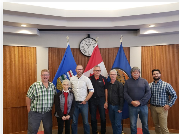
Meeting with Big Lakes County Council in High Prairie