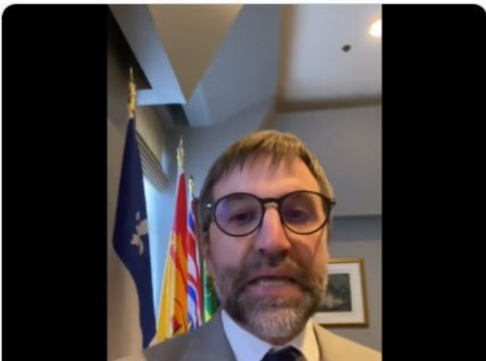
(Fig. 3: Guilbeault highlighting #30x30)

Steven Guilbeault @s_guilbeault · May 25 At the FPT meeting to advance priorities with provincial and territorial counterparts and invite them to join the federal government's efforts to protect 30 % of land and water by 2030. #30x30