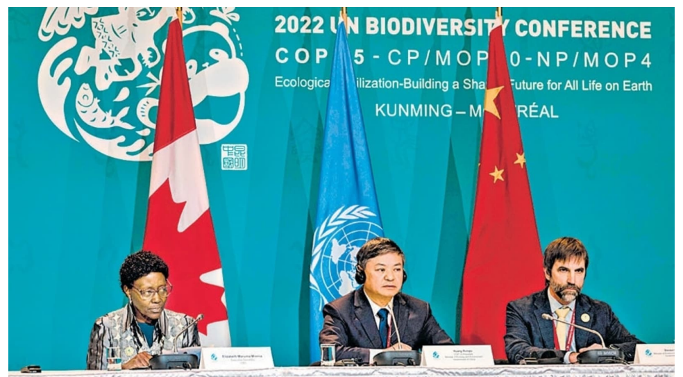
(Fig. 1: Canada and China joined together to establish UN Biodiversity Framework in Montreal—December 2022)

Target 3 has been the one to attract the most attention from the media. It calls for protecting 30% of Canada’s ecologically pristine land and water by 2030.