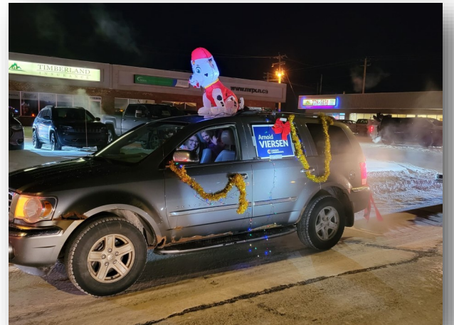
Whitecourt Christmas Parade