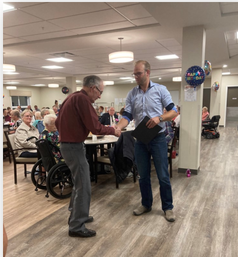
Celebrating at Hillcrest Lodge with people from across the riding who turned 90+