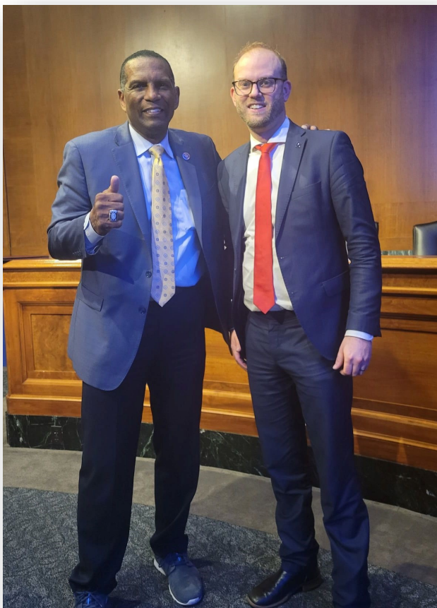
Met with Congressman Burgess Owens a Republican from Utah focused on Faith, Family, Free Market, and Education. We share a passion for fighting human trafficking.