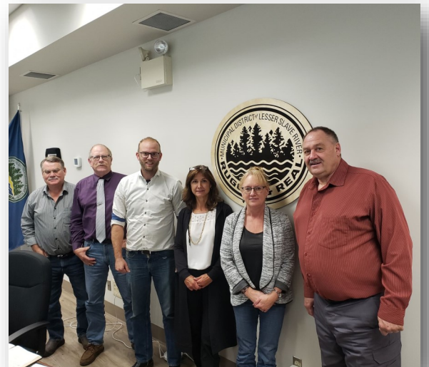
Meeting with MD of Lesser Slave River