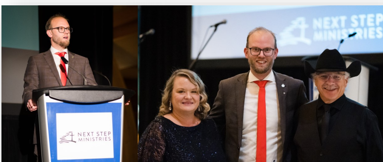
Bringing greetings at Calgary-based Her Next Step Gala that supports recovery and services for victims of sex trafficking