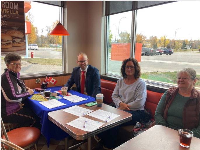
Meeting for coffee with constituents in Slave Lake