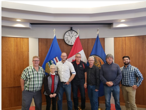
Meeting with Big Lakes County Council in High Prairie