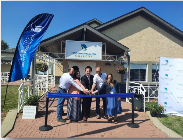
Opening of Northern Lake College - Fox Creek campus