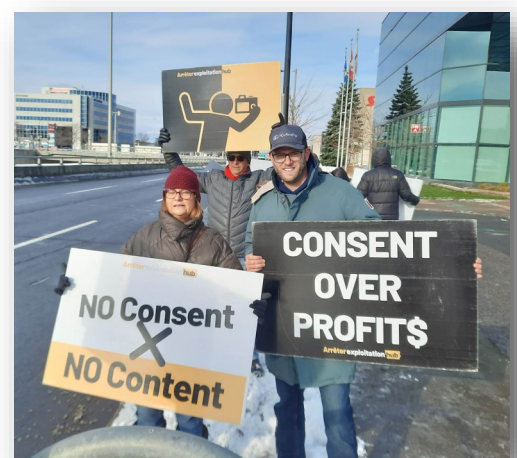
Protested outside MindGeek/Pornhub with Independent Senator Julie Miville-Dechêne .