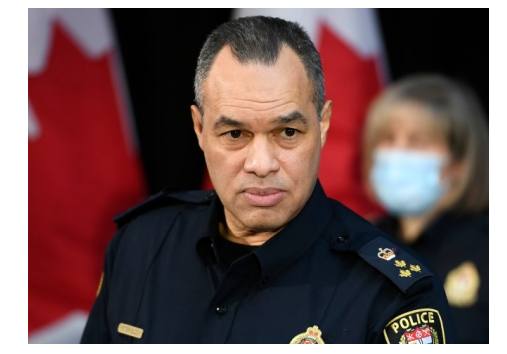
"I did not make that request."

RCMP Commissioner Brenda Lucki when questioned if RCMP asked the government for the Act